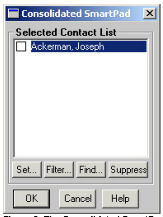
Figure 2: The Consolidated SmartPad search tool.

• CDS will open the Consolidated SmartPad search tool.