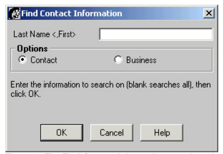
Figure 3: The Find Contact Information search tool.

• CDS will display a list of contacts meeting the entered search criteria.