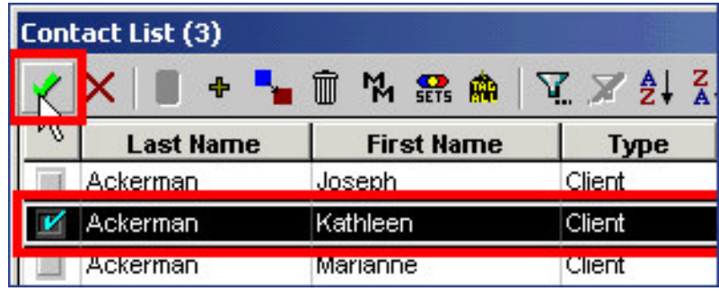
Figure 4: The Contact List (search results displayed).

• CDS will display a list of contacts meeting the entered search criteria.