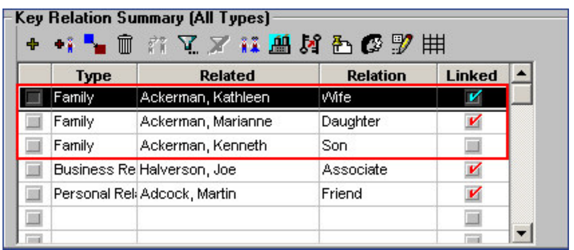
Figure 8: Contacts linked as Family relations in the Key Relation Summary of the Key Relations tab.

CDS will open a Consolidated SmartPad displaying records for contacts linked as family members to the original contact on the Key Relations tab of the Contact Record.