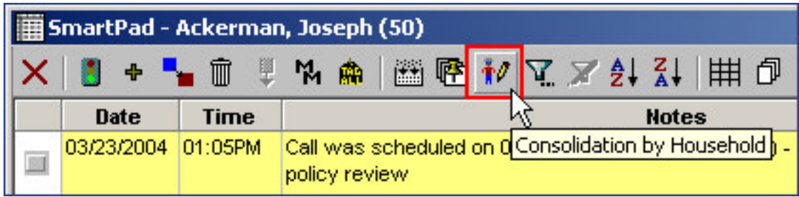
Figure 7: The Consolidation by Household button.

CDS will open a Consolidated SmartPad displaying records for contacts linked as family members to the original contact on the Key Relations tab of the Contact Record.