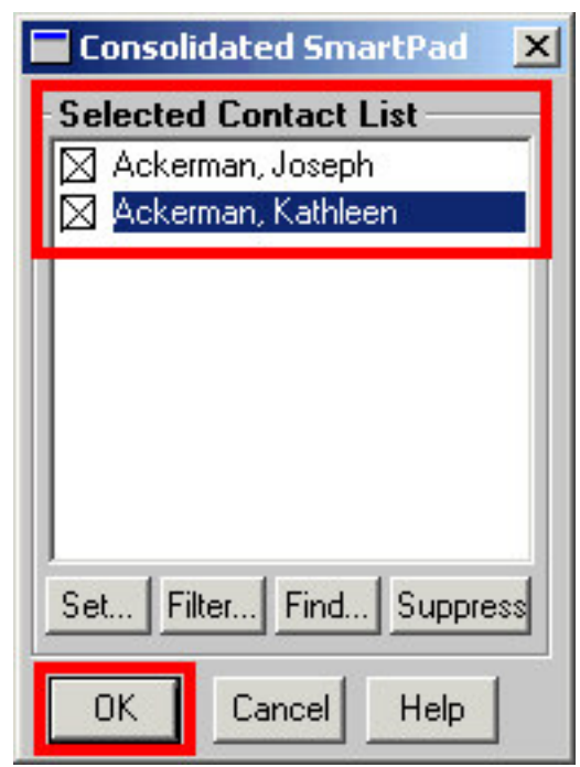
Figure 5: The Selected Contact List section of the Consolidated SmartPad search tool.

CDS will open a Consolidated SmartPad displaying SmartPad entries for all selected contacts.