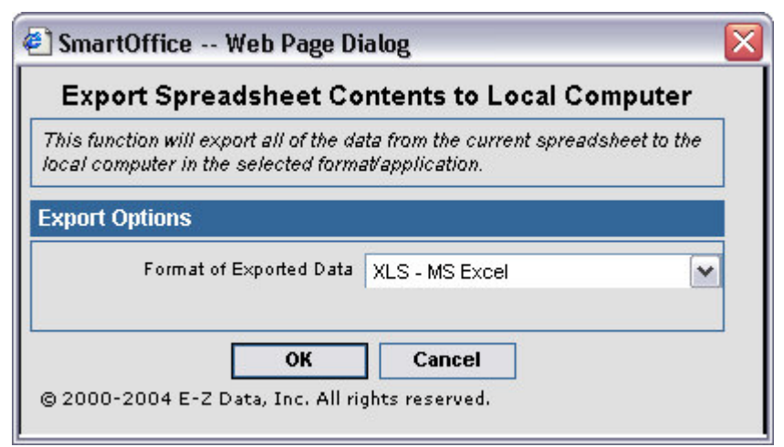
Figure 3: The Export Options screen (XLS- MS Excel format selected).

Note: The drop-down in the Format of Exported Data field can be used to export data in CSV (Comma Separated Value), XML, or Tab Separated formats.