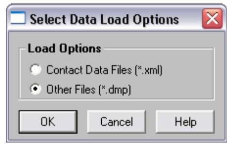
Figure 4: The Select Data Load Options window.