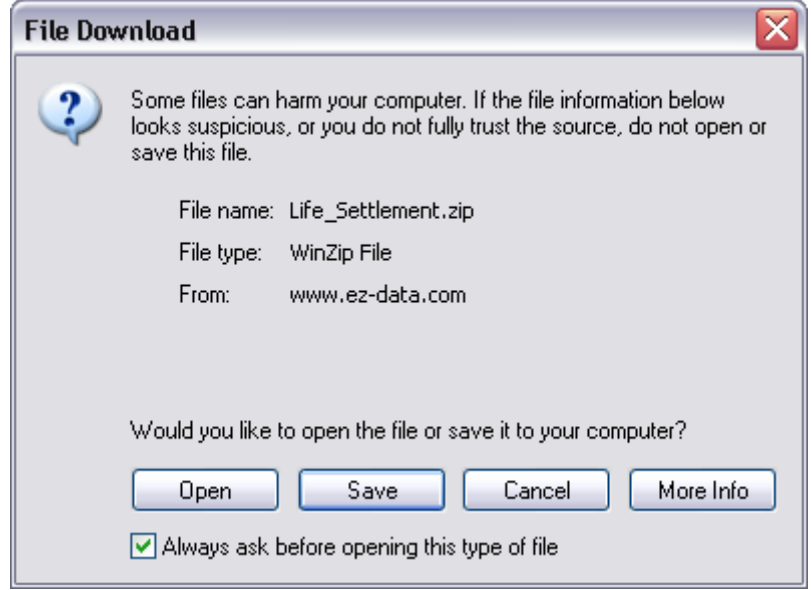
Figure 2: The File Download window.

• When the File Download window opens, click the Save button.