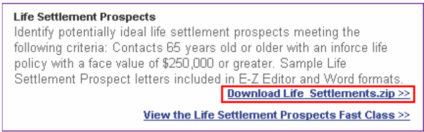
Figure 1: Dynamic Report selection on the Dynamic Report Download page - <a href="http://www.ez-data.com/support/cdsdrdown.shtml">http://www.ez-data.com/support/cdsdrdown.shtml</a> (Download Life_Settlement.zip >> highlighted).

From the Dynamic Report Download page, select the dynamic report and click the download link.